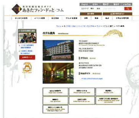
*The images are for illustration purposes.